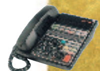
20 Button Basic