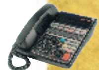
20 Button Standard