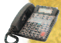
20 Button Display