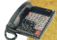
32 Button Standard