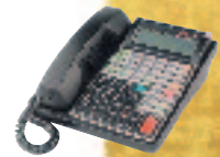
32 Button Display